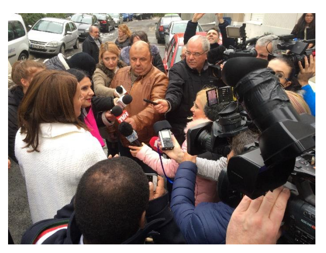
Minister of Health at the launch of the screening