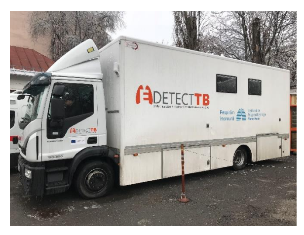
Mobile X-ray unit